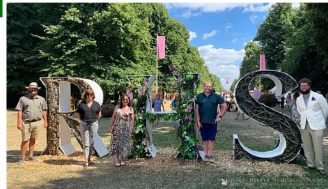
PMG visit to Hampton Court Flower Show

Fruit producing planting - we are delighted to have had a good crop of pears, grapes, currents and apples and welcome our visitors to pick the ripe fruit ( just ask one of our gardening team! )